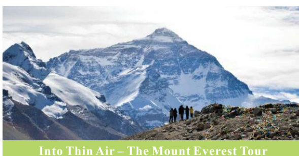
Into Thin Air - The Mount Everest Tour