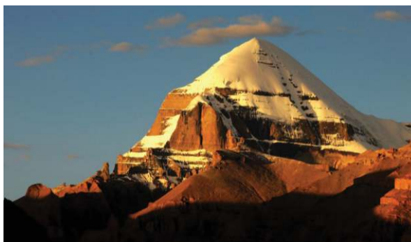
Sacred Isolation - The Mount Kailash Tour